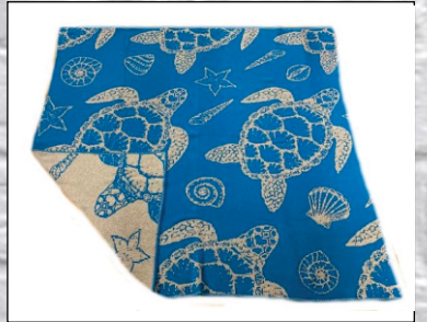
Turtles #22200 46"x50" 50% cotton/50% poly