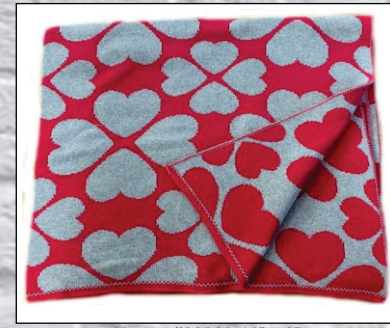
Hearts #22230 46"x50" 50% cotton/50% poly