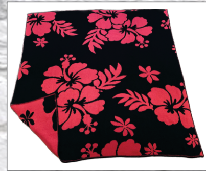
Hibiscus #20110 46"x50" 50% cotton/50% poly