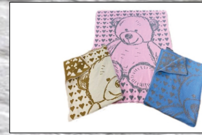
Teddy Bear #30015 30"x40" 50% cotton/50% poly natural/tan, pink/gray, blue/gray