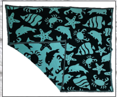
Sea Life #20080 46"x50" 50% cotton/50% poly