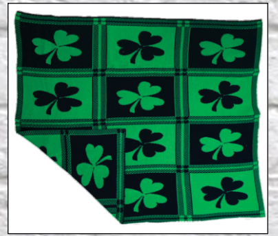
Shamrock #20060 46"x50" 50% cotton/50% poly