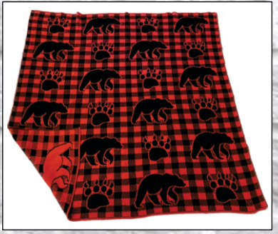
Bear #20050 46"x50" 50% cotton/50% poly