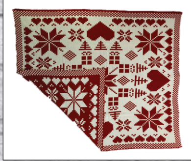
Nordic #20090 46"x50" 50% cotton/50% poly

Fully-custom throws available-please contact us for more info.