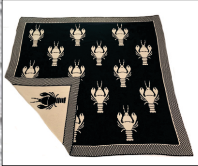
Lobster #20010 46"x50" 50% cotton/50% poly