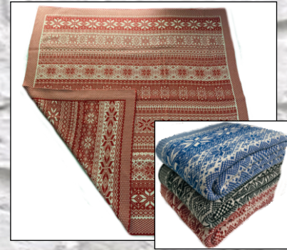
Snowflake #20030 46"x50" 50% cotton/50% poly (red, dark green, blue available)