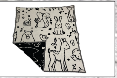
Forest Animals #30010 30"x40" 50% cotton/50% poly