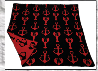
Lobster #24210 46"x50" 50% cotton/50% poly