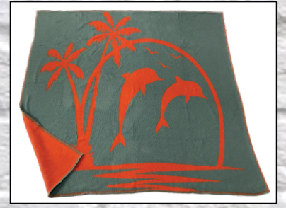
Dolphin #24200 46"x50" 50% cotton/50% poly