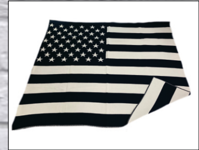
Navy Flag #20100 46"x50" 50% cotton/50% poly